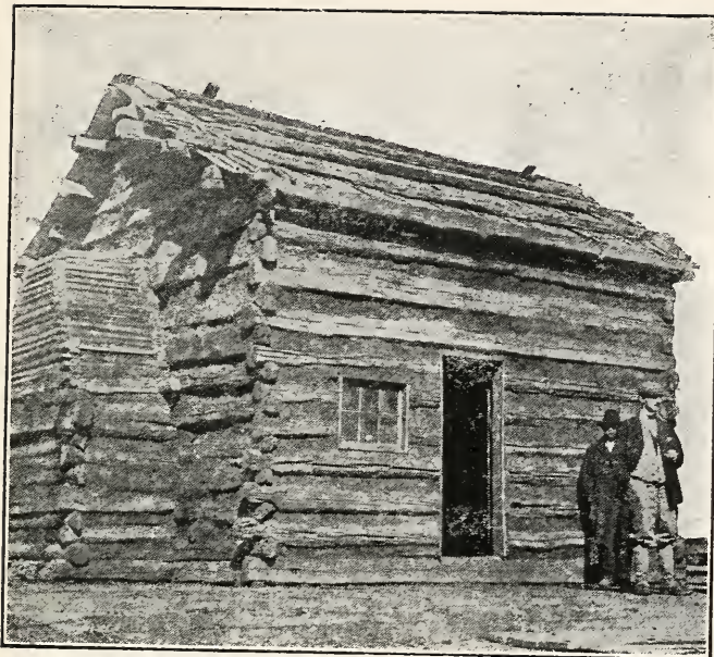
LINCOLN'S BIRTHPLACE, NEAR HODGENVILLE, KY.