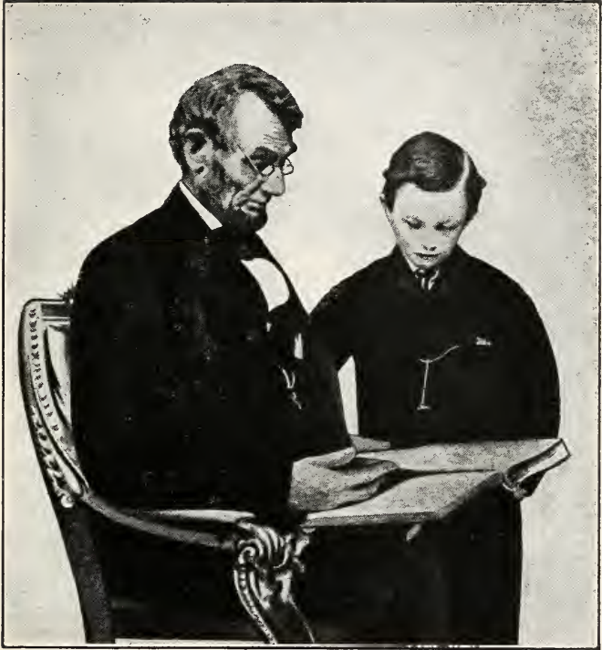
LINCOLN AND HIS SON "TAD."

From photograph taken while Lincoln was President.