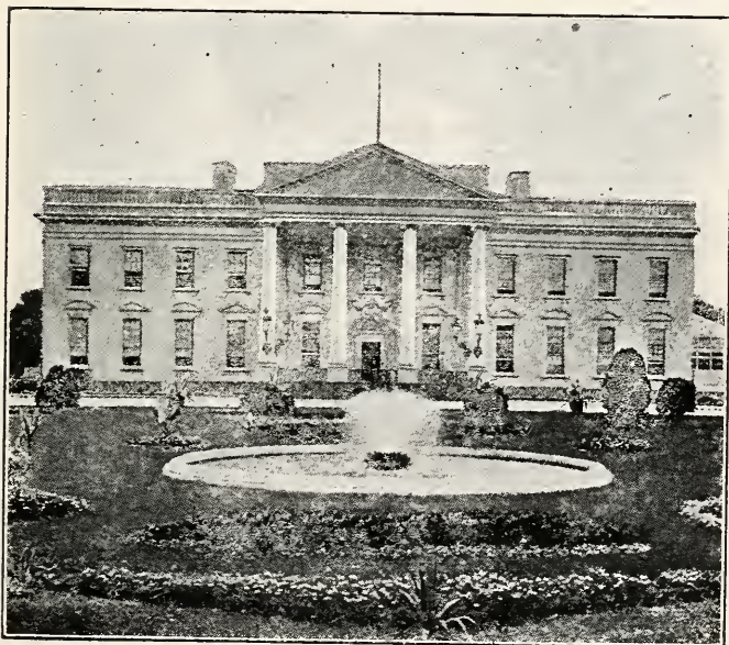
THE WHITE HOUSE AS LINCOLN ENTERED IT. From photograph taken in 1861.