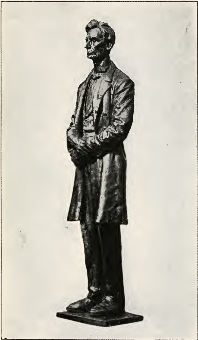
BARNARD'S STATUE OF LINCOLN.