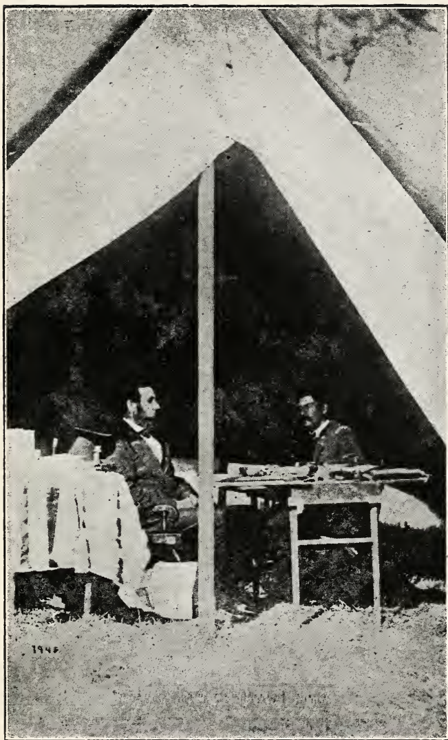
PRESIDENT LINCOLN AND GENERAL McCLELLAN AT ANTIETAM, OCTOBER 2, 1862, SOON AFTER THE BATTLE.

Photograph by Brady. From the collection of Frederick Hill Meserve, New York City.