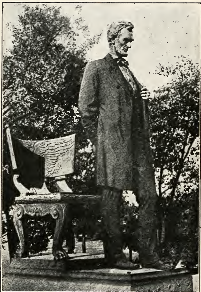
ST. GAUDENS' STATUE OF LINCOLN, IN LINCOLN PARK, CHICAGO.